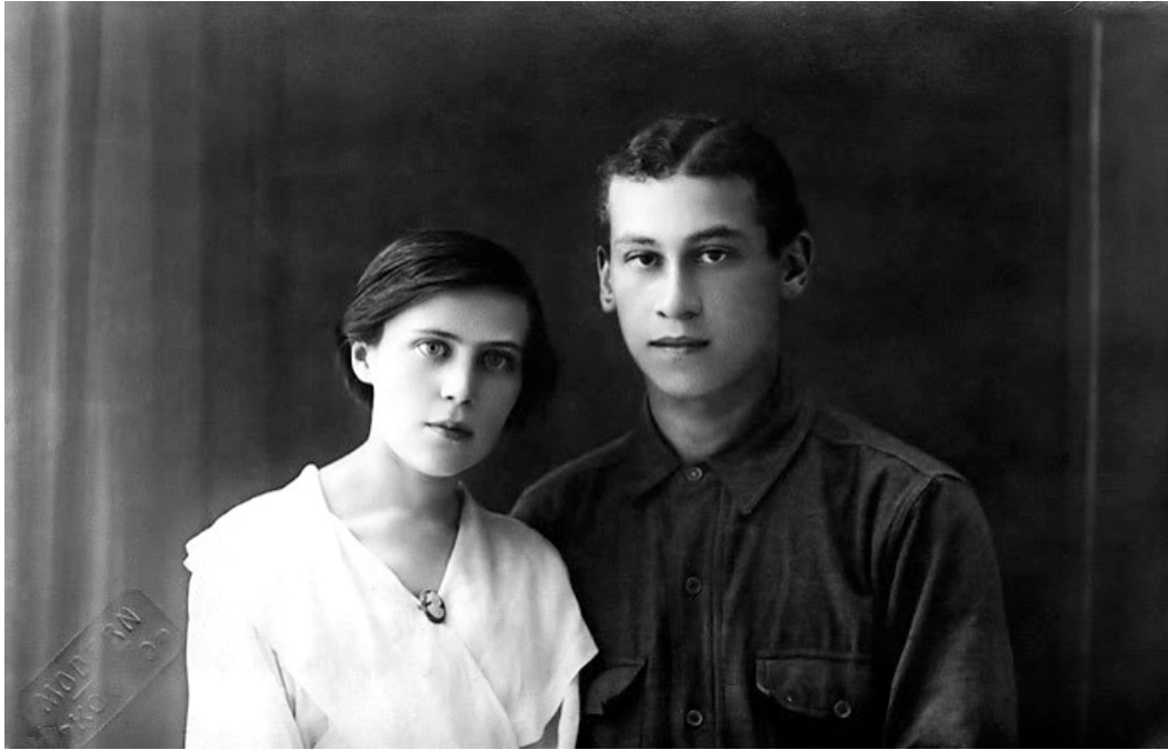
Figure 2. Bluma and Albert Zeigarnik in Kovno, modern Kaunas (1919-1920) 1

long-term memory, are evanescent and disappear with time. An incomplete task is accompanied by a state of psychological tension (“quasi-necessity”), which is only released when the task is finished. The motivation caused by this tension is what makes us better remember unfinished tasks. 2,5,6