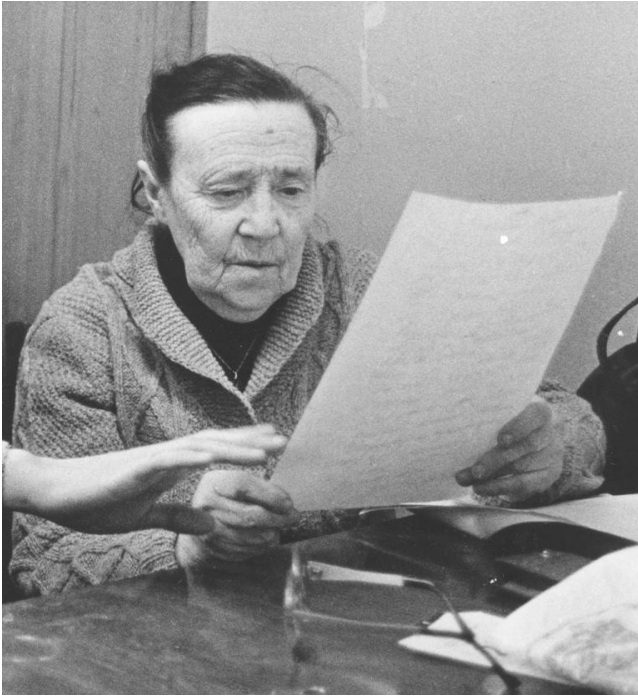
Figure 5. Bluma Zeigarnik in 1980

of psychopathology (1973), and Pathopsychology (1976); some of these works were translated into different languages, including Spanish. 1,7,16,20