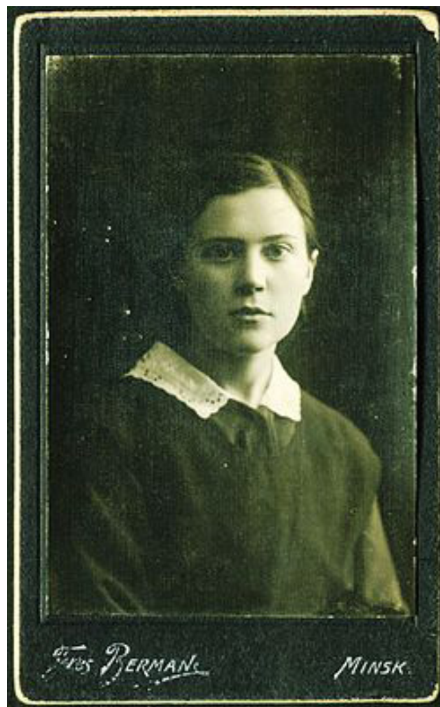
Figure 1. Bluma Zeigarnik as a student in Minsk

Zeigarnik collaborated with Lewin in several experiments to confirm his force-field analysis theory. One of these projects, performed between 1924 and 1926 and whose results were published in 1927, led to her international recognition: "Über das Behalten erledigter und un-erledigter Handlungen" (On finished and unfinished tasks). This project initially included 164 subjects (children, students, and teachers) and later included more reduced groups, who were asked