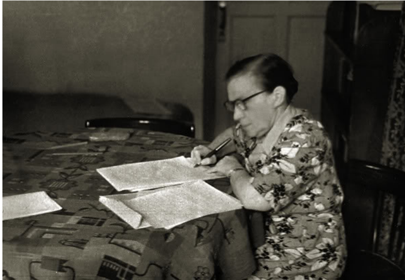
Figure 4. Bluma Zeigarnik working at home

Psychological experimentation may aim to analyse the structure and determine the degree of a patient's psychic alterations and intellectual degradation, regardless of their diagnosis, for example when analysing the quality of remission due to pharmacological or psychotherapeutic treatment effectiveness. 16